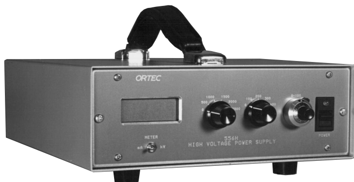
556H "Bench-Top" High-Voltage Power Supply.